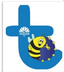
Foreign Language Translation Bee