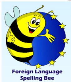
Foreign Language Spelling Bee