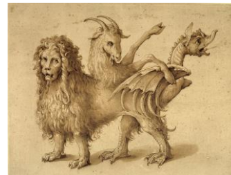
Chimera Hybrid of more than one animal