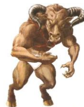
Minotaur Half man, half bull