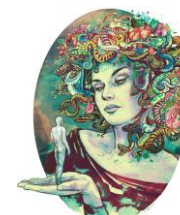
Medusa Snakes for hair, can turn you to stone (petrify)