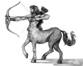
Centaur Half man, half horse, archers