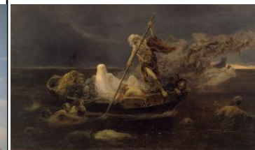
River Styx Cross to the Underworld