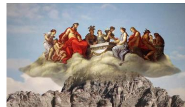
Mount Olympus Where the gods live at pleasure