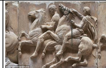
Frieze A band of sculpture on building