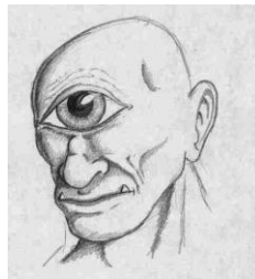
Cyclopes Giant with eye on forehead