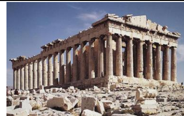
The Parthenon in Athens Typical use of columns