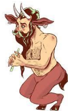
Satyr Half man, half goat