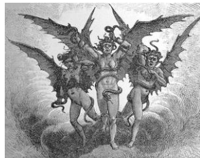
The Furies Minions sent from the Underworld