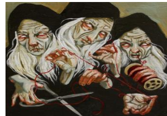
The Fates Weavers of the destiny of men